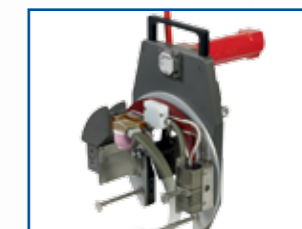
MU IV with AVC/OSC