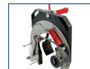
MU IV with integrated wire feeder