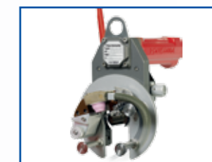
MU IV for use with external wire feeder