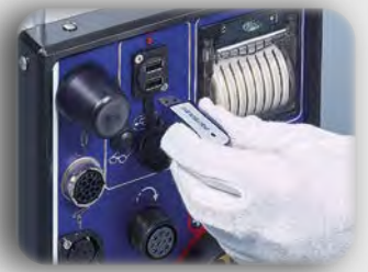
USB memory stick for saving, loading and archiving of welding programs and monitored welding data