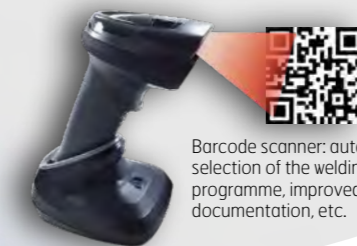
Barcode scanner: automatic selection of the welding programme, improved documentation, etc.