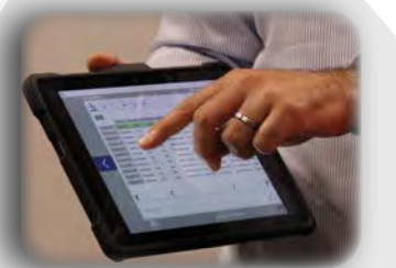
Wireless touchscreen controller LAN/WLAN based programming by free-of-charge "Plug & Play" software or Windows® PC