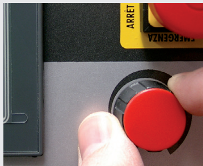
/ Multifunctional rotary button