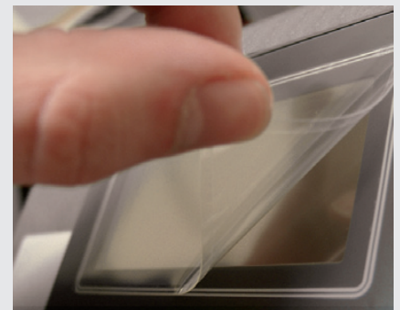
/ Exchangeable protective film