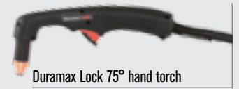
Duramax Lock 75° hand torch

(for more torch options, see www.hypertherm.com )