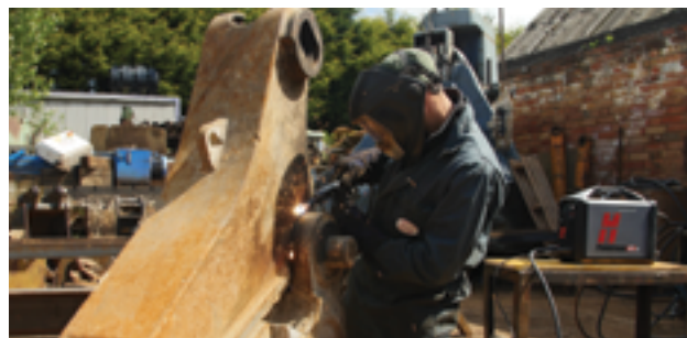
Maintenance and repair