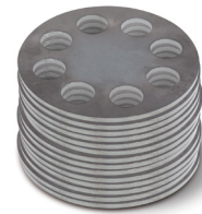
Without Rapid Part

Parts produced using the same cutting machine, the same cut speed and the same cutting time duration.