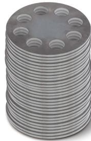
With Rapid Part

When purchasing a new cutting table be sure to ask about cut-to-cut cycle time. Some cutting table manufacturers are able to deliver similar results using their own CNC, THC, and nesting software products combined with Hypertherm plasma systems.